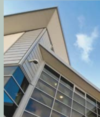
Above and front cover: The Breast Care and Cancer Prevention Centre at the University Hospital of South Manchester NHS Foundation Trust, Wythenshawe