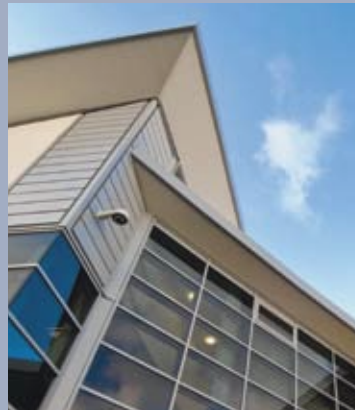
Above: The Nightingale Centre and Genesis Prevention Centre at the University Hospital of South Manchester NHS Foundation Trust, Wythenshawe